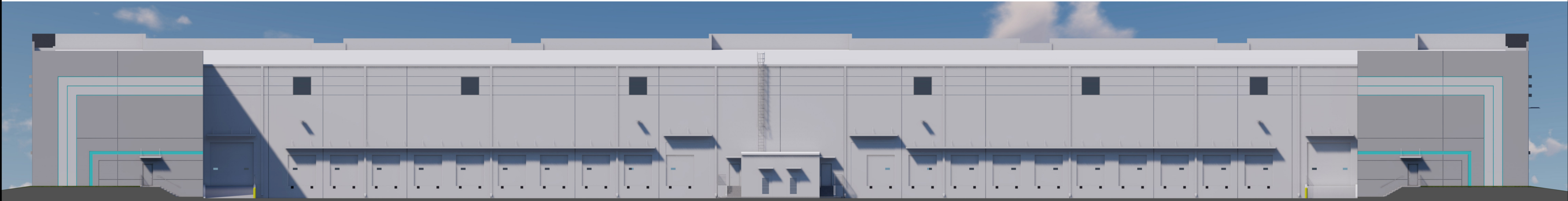
2 WEST ELEVATION N.T.S.